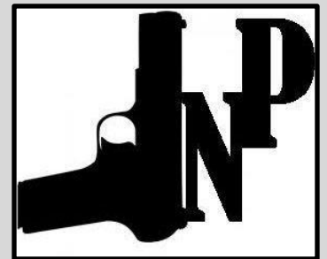
Northern Plains Gunworks